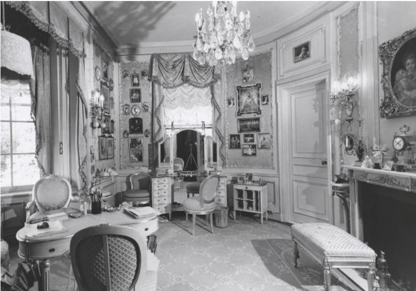
Marjorie Post's Hillwood Dressing Room

Marjorie Post believed in living a healthy, active lifestyle. She began each day at Hillwood with morning exercises in her dressing room. In the afternoon, she walked her garden paths for exercise.